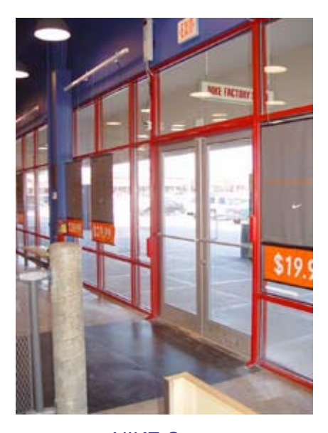
NIKE Store Sky Guard Installation Installed by WG/Sensorsense in the United States

The WG Sky Guard is being well received in the retail market. Installation are being done daily through out the United States and the rest of the world. Some of the stores that are using the Sky Guard are Nike, Guess, Gucci, Garden Centers, Virgin Megastores, Tommy Hilfiger and Blockbuster. These are just a few retailers that are having tremendous success.