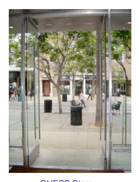
GUESS Store Sky Guard Installation Installed by WG/Sensorsense in the United States